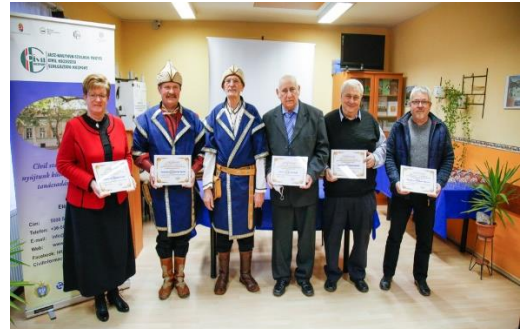
Rewarding excellence in civil society initiatives, 2022.02.03