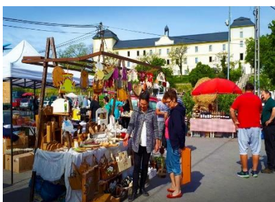
The traditional open air marketplace in Veresegyház