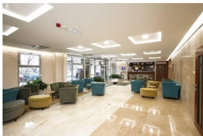
Medos Hotel, the reception