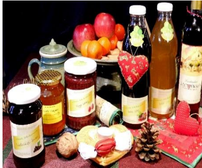
Local food of Dunakanyar (Danube blend) in Szentendre