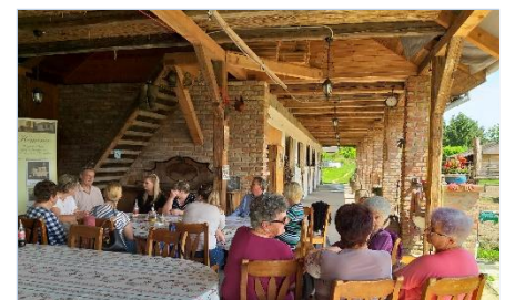
Free time at Tata Folk High School