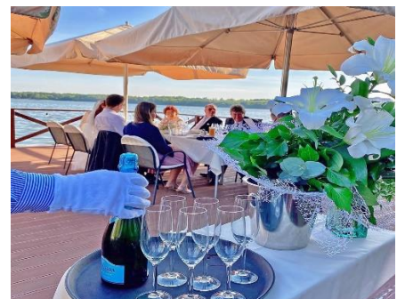
Grill Restaurant Tata