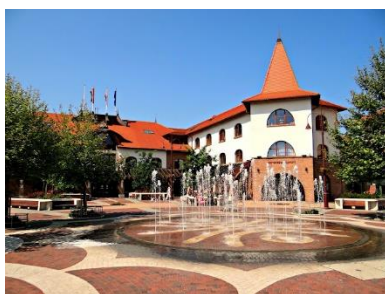
Veresegyháza main square

19:40 Departure from Airport – arrival at Copenhagen Airport (CPH) at 21:35