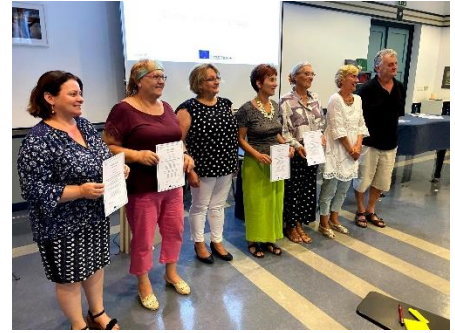
Certification at FHSASB