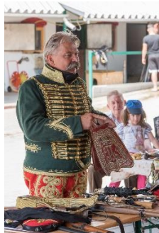
Traditional summer camp