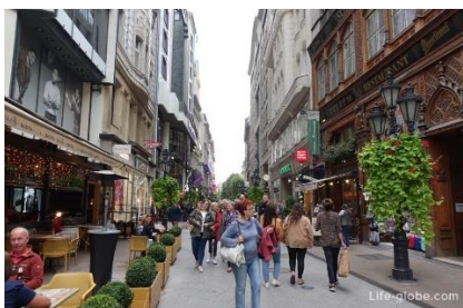
Váci Utcát, the main pedestrian street in Budapest