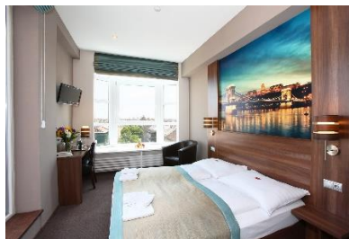
Medos hotel, double room