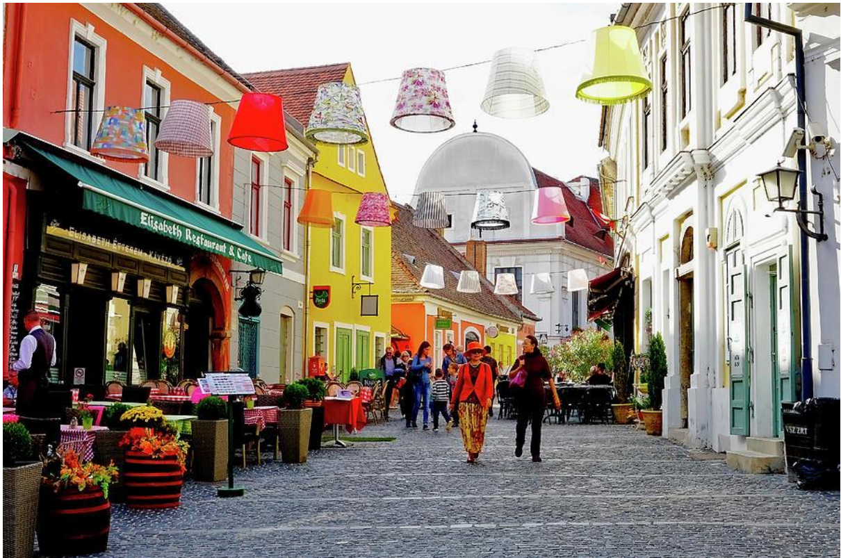
Pedestrian street in Szentendre

5-day study visit to Hungary, Saturday - Wednesday, 25th – 29th of June 2022