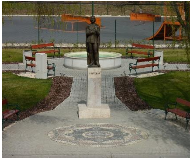
Mosaic in Kistarcsa, prepared in a Grundtvig supported course.