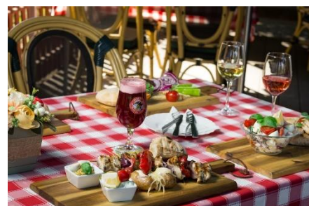
Haldorádó Restaurant at Ivacsi lake at Veresegyház