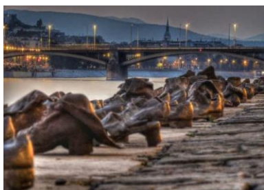
Memorial holocaust at Danube river. Shoes represents victims left.

Evening: Common dinner nearby the hotel.