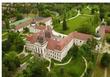
Royal palace of Godollo, from above