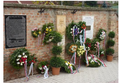
The memorial wall of a former detention working camp in Kistarcsa, created by host.