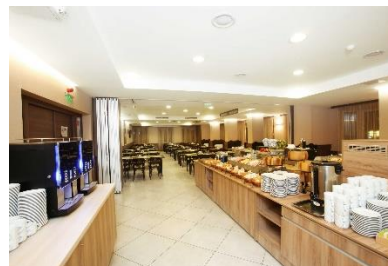
Medos Hotel, breakfast room