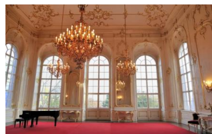
Sala Piano, Godollo