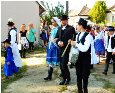
Harvest grape parade - organized each year in Kistarcsa.