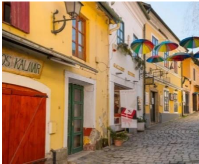
Street in Szentendre city