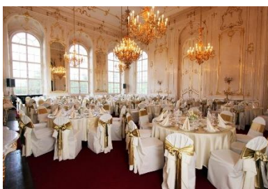
Royal palace of Godollo, dining room