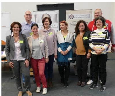
The team from Tata Folk High School