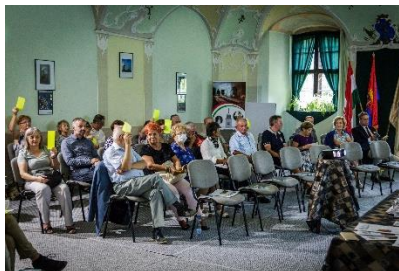
Learning session at Tata Folk High School