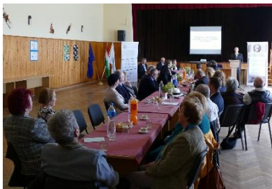
Official meeting at Tata Folk High School